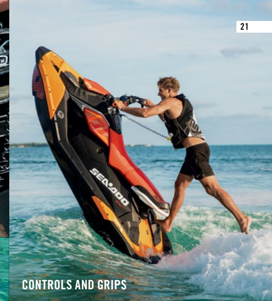
CONTROLS AND GRIPS