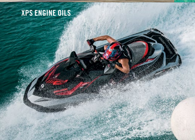
XPS ENGINE OILS